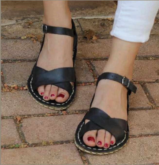
huarache II €99