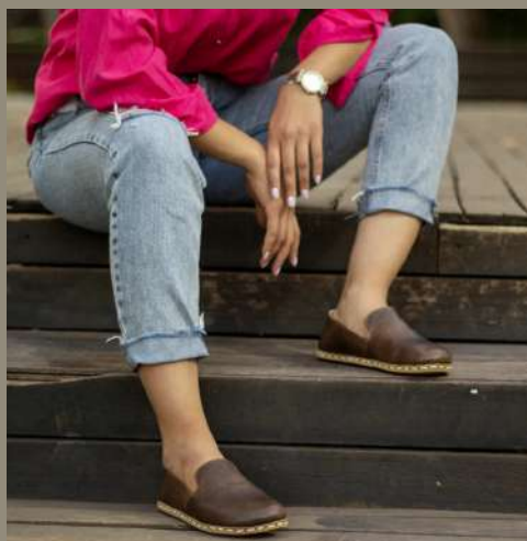
classic brown (10)