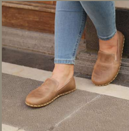
milky brown (5)