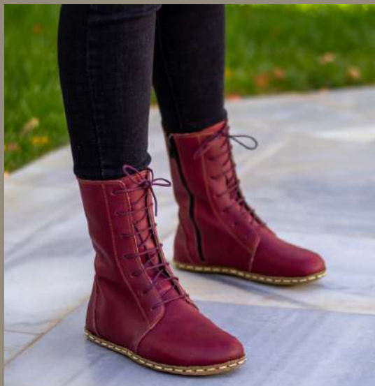
lace-up boots €139