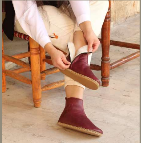
hiking boots with wool lining €129 without wool lining €119