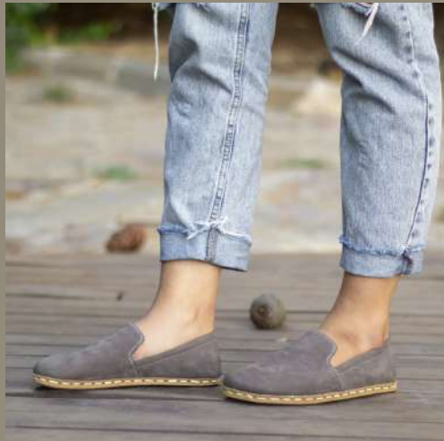
gray nubuck (1)