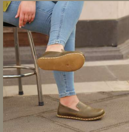
military green (6)