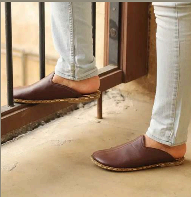
yemeni slippers €99