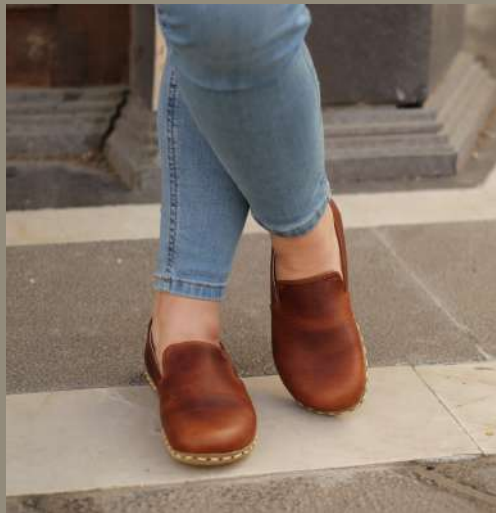
crazy new brown (4)