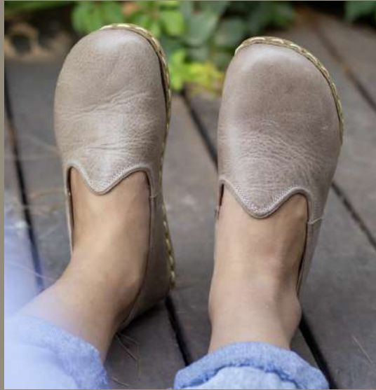
round yemeni €99