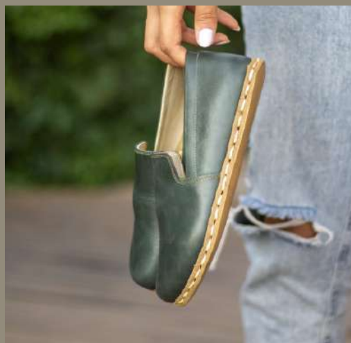
toledo green (8)