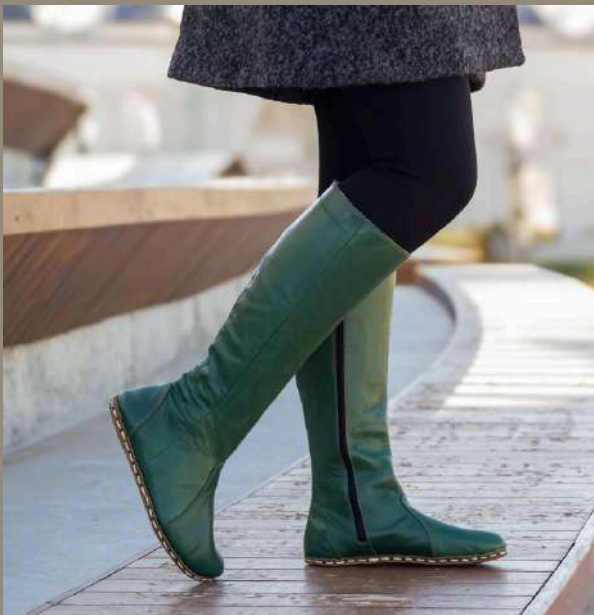
tall boots €159