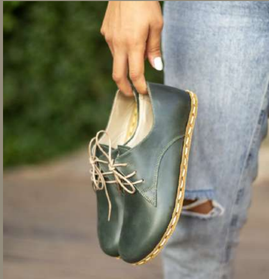
classic sneakers €99