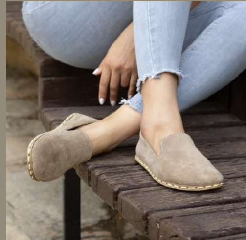
milky brown suede (3)