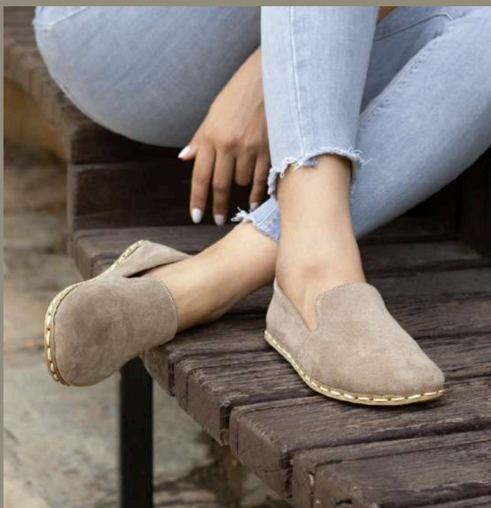
flatline yemeni €99