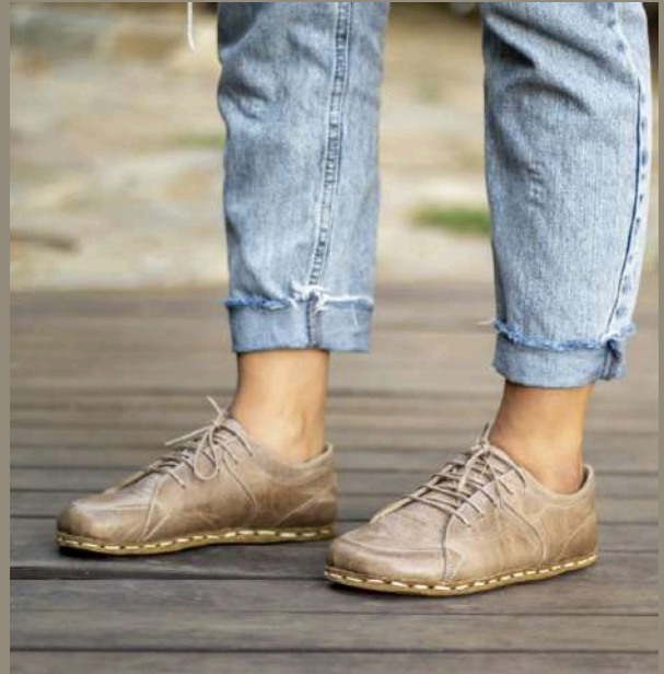
casual sneakers €109