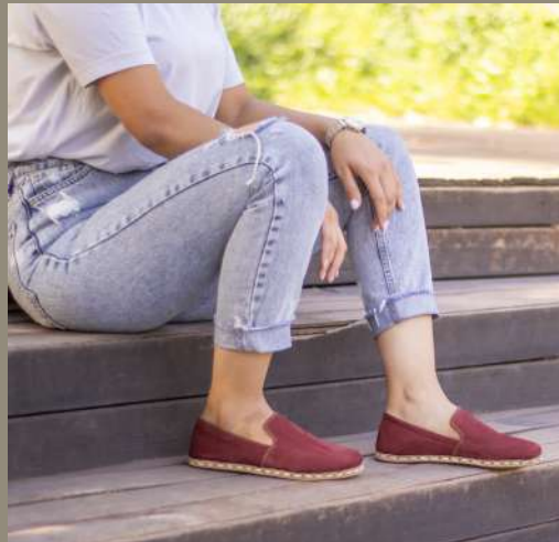
burgundy nubuck (2)