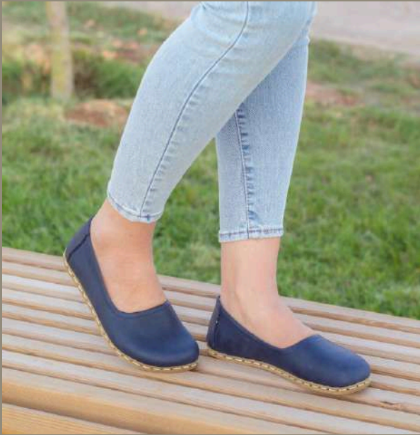
ballet flats €99