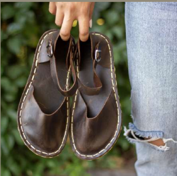
claret sandals €99