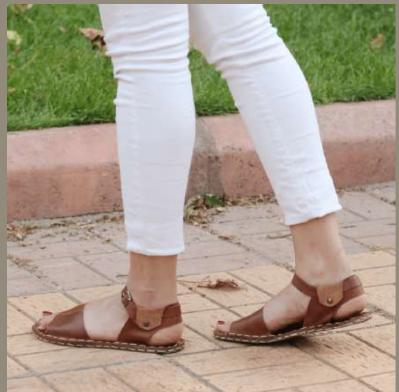
huarache sandals €99