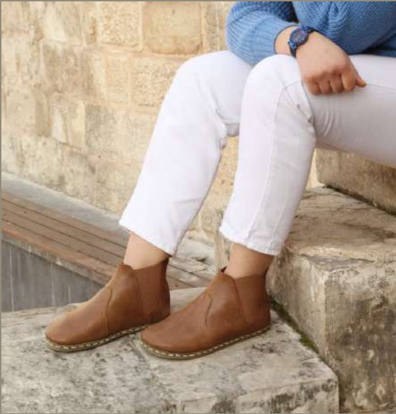
chelsea boots €119